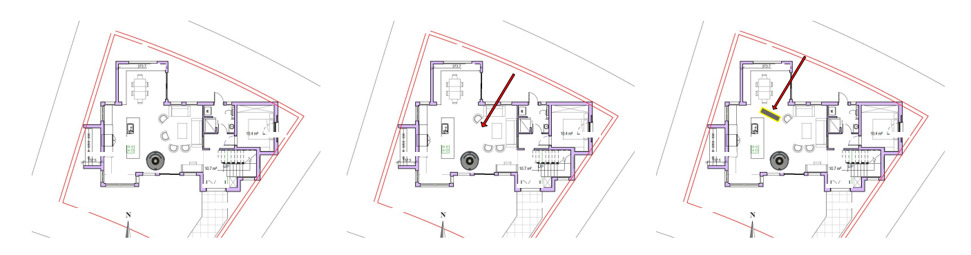
Figure 1: An example of an ER-UMD problem

essary for the application of other modifications (e.g. a docking station can only be added after adding a power outlet).